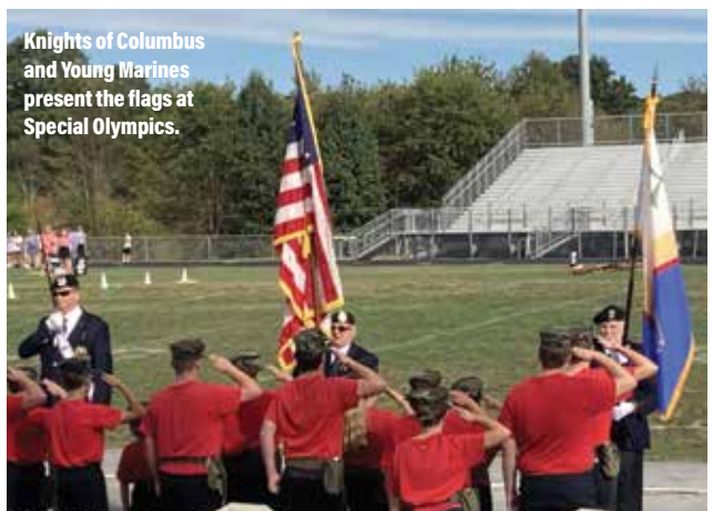
Knights of Columbus and Young Marines present the flags at Special Olympics.