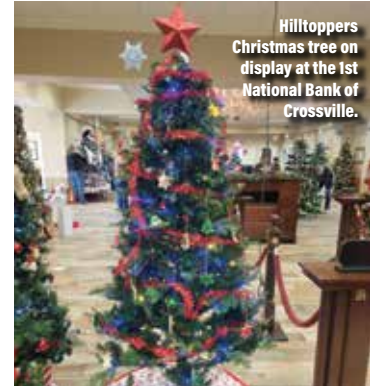
Hilltoppers Christmas tree on display at the 1st National Bank of Crossville.

Hilltoppers folks wanted to spread joy everywhere! For one particular project, Operation Santa Bag, sponsored by The Arc of Cumberland County, filled gift bags were given to members of the special needs community who don't have family at Christmas. The donations included new sheets, toiletries, socks and shoes, and personal gifts to individuals in our community who need it most. Sometimes it does mean more to give than to receive.