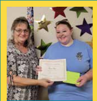
SEPTEMBER 2023 TOMICA STEPP DIRECT SUPPORT PROFESSIONAL