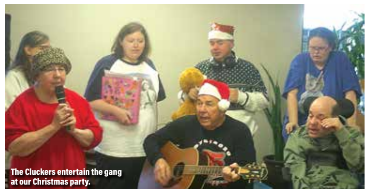
The Cluckers entertain the gang at our Christmas party.