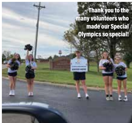
Thank you to the many volunteers who made our Special Olympics so special!